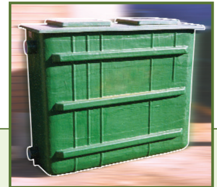
AGLASS GENERAL PURPOSE PIT

Pretreated washwater is delivered from the VT1300 Automatic Pump Station to stormwater.